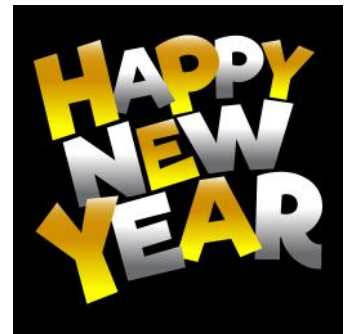
"I like the dreams of the future better than the history of the past."