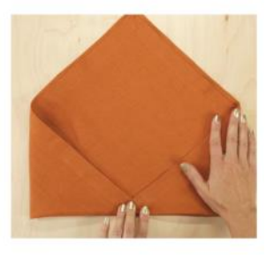
Step 4 Repeat for the RIGHT corner.

Step 3 Fold the LEFT corner in so the tip sits JUST past the midway point on the long edge of the triangle.