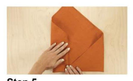
Step 5 Fold the LEFT edge over, bringing it to the midpoint of the napkin. Smooth down the left edge.